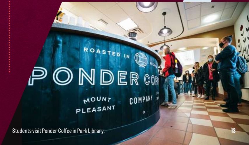
Students visit Ponder Coffee in Park Library.