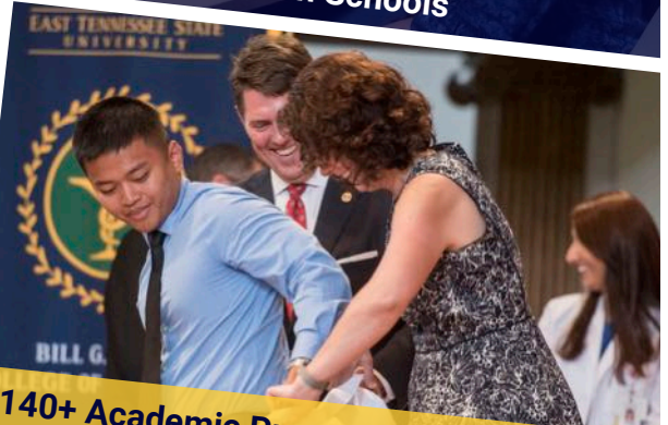
140+ Academic Programs; 50+ Graduate Programs and 35 Certificates