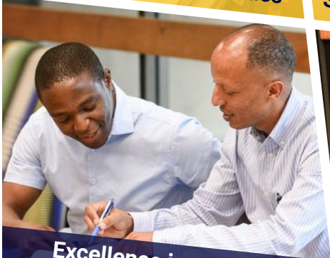
Excellence in Student Services