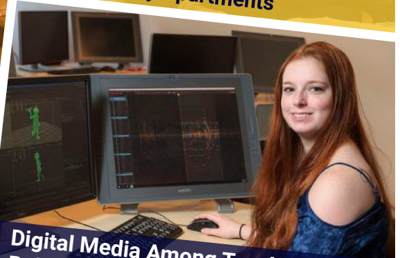
Digital Media Among Top 40 Public Animation Schools