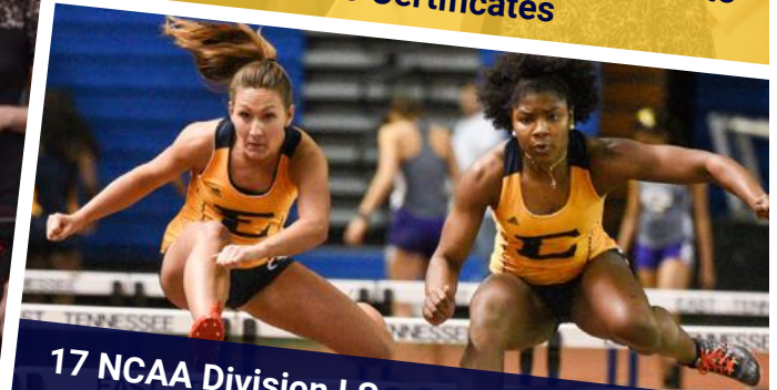
17 NCAA Division I Sports