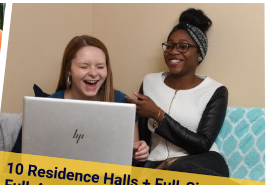
10 Residence Halls + Full-Size, Full-Amenity Apartments