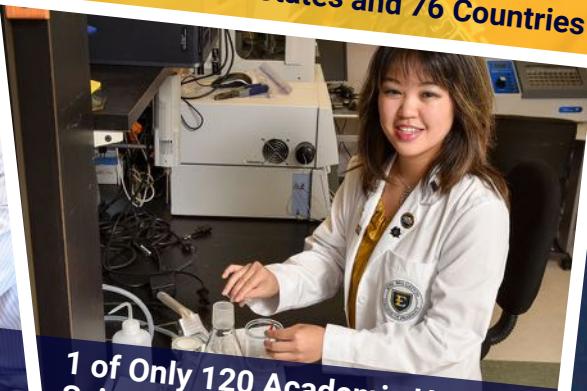
1 of Only 120 Academic Health Science Centers in the Nation