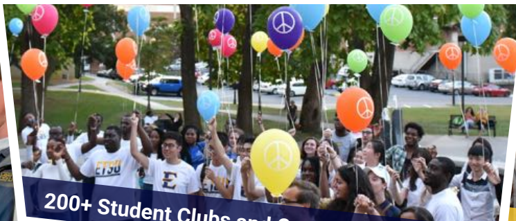
200+ Student Clubs and Organizations