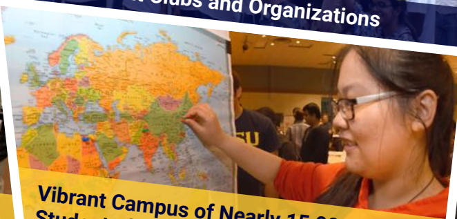
Vibrant Campus of Nearly 15,000 Students from 45 States and 76 Countries